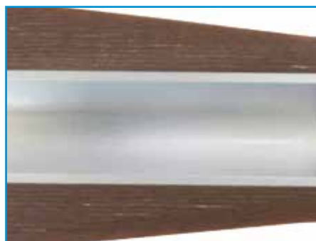
Cut from a RIP active part