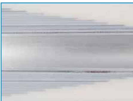
Cut from a RIS active part